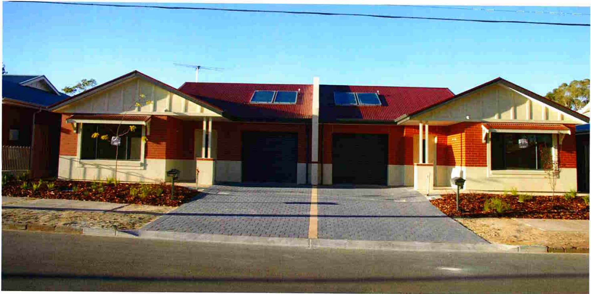
MAGILL INDEPENDENT LIVING UNITS UNIT TYPE N1