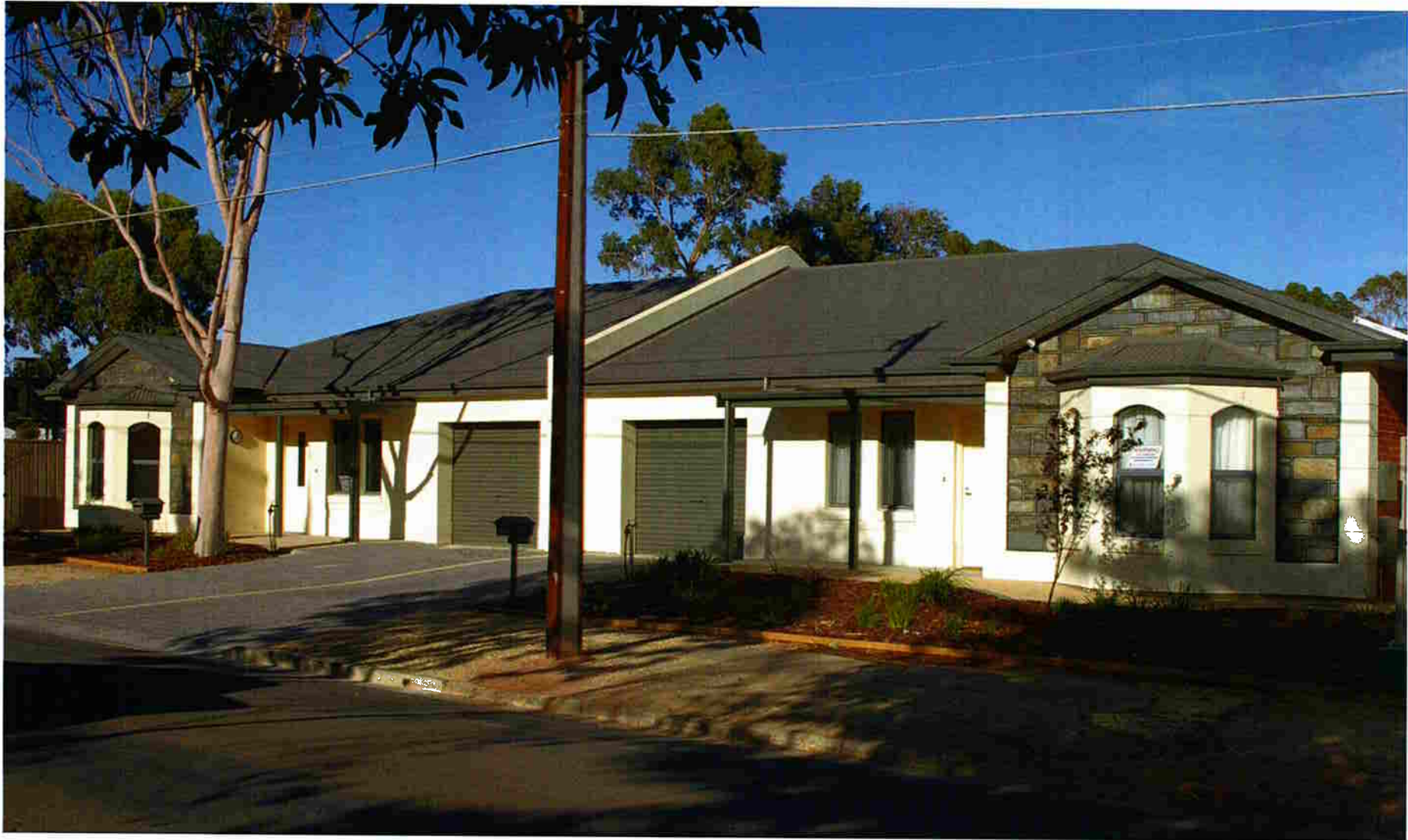
MAGILL INDEPENDENT LIVING UNITS UNIT TYPE O1